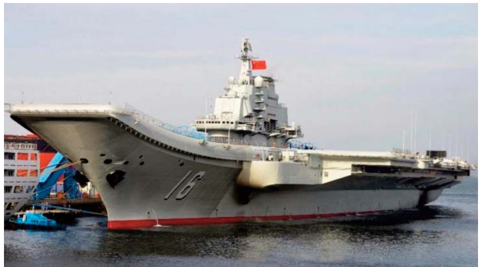
China's first aircraft carrier, the Liaoning

Like most things in the Middle East, Israel's national dog breed—the Canaan dog—has been around for a very, very long time. Adorably occupying an ecological niche based on waste .