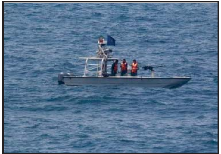
Iranian Patrol Boat